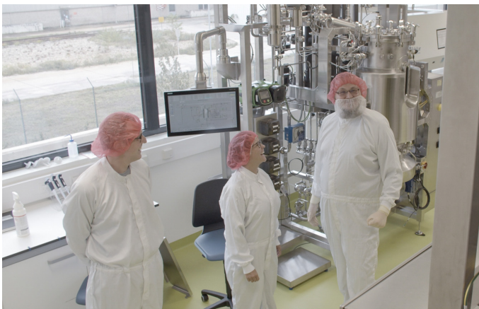
Upstream production in the GMP clean room area.

Biomay secured a site and building permits in Aspern Seestadt, a northeastern suburb of Vienna. Aspern Seestadt is one of Europe's largest urban development projects, known for its "green", eco-friendly profile. In addition to providing cutting-edge technology, sustainable design is a key part of the district's profile. And indeed, the facility is equipped with a groundwater heat pump for cooling and heating the entire building as well as solar panels for fossil-free electricity supply.