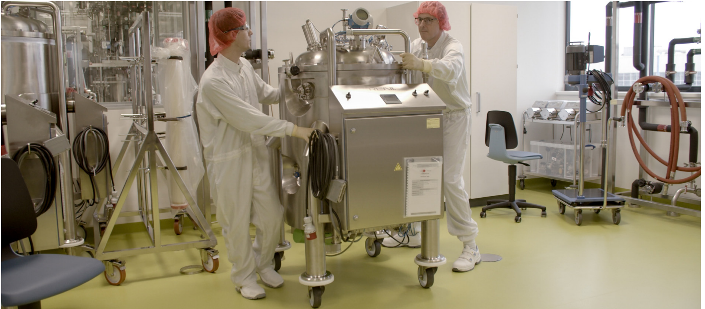
Bioreactors and other equipment are placed on wheels to allow for flexible batch configurations and cleaning.